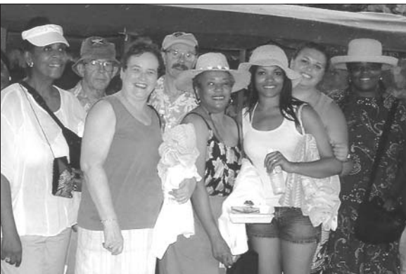
Members of First Presbyterian Church and Hillside Presbyterian Church arrive in Jamaica.