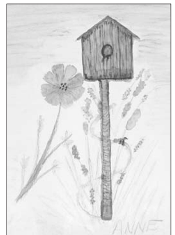
Artwork created by Art Therapy Ministry client.