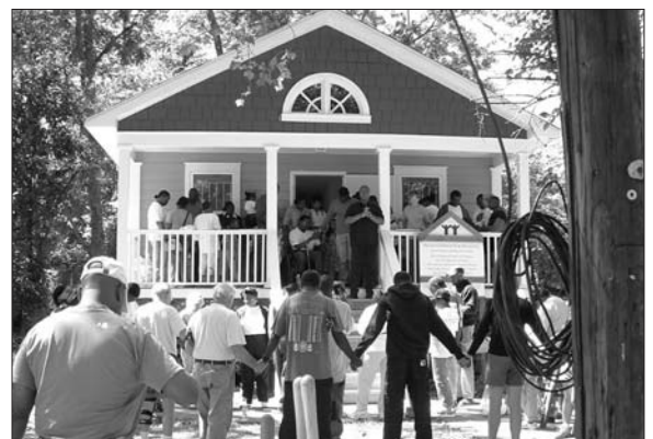
Celebrating and dedicating a new home built by Habitat for Humanity with First Presbyterian Church volunteers.